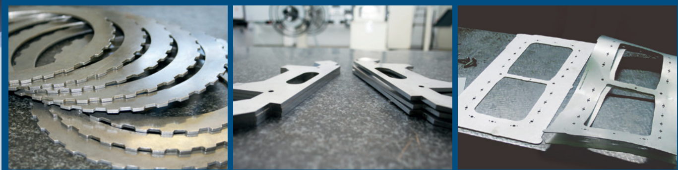
EcoMaster® – Consistent leveling results. Ideal for the use in the automotive industry, laser job shops and aerospace industry.

Unique - The ARKU quick-change system offers the advantage of cleaning and changing the leveling rollers and back-up rollers in just a few minutes.